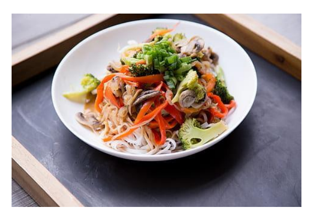
Oriental Salad (online photo sample) Recipe Compliments of Gene Geiger